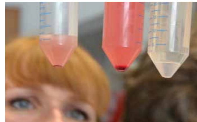
Scientific research is the basis for the development of the Q-graft®

Extensive research work in collaboration with renowned medical universities has been the basis for the development of the Q-graft® system, enabling the realization of cutting-edge technologies for the separation and concentration of adipose derived regenerative cells in a compact closed system, to be used on the sterile OR instrument table in the operating/procedure room.